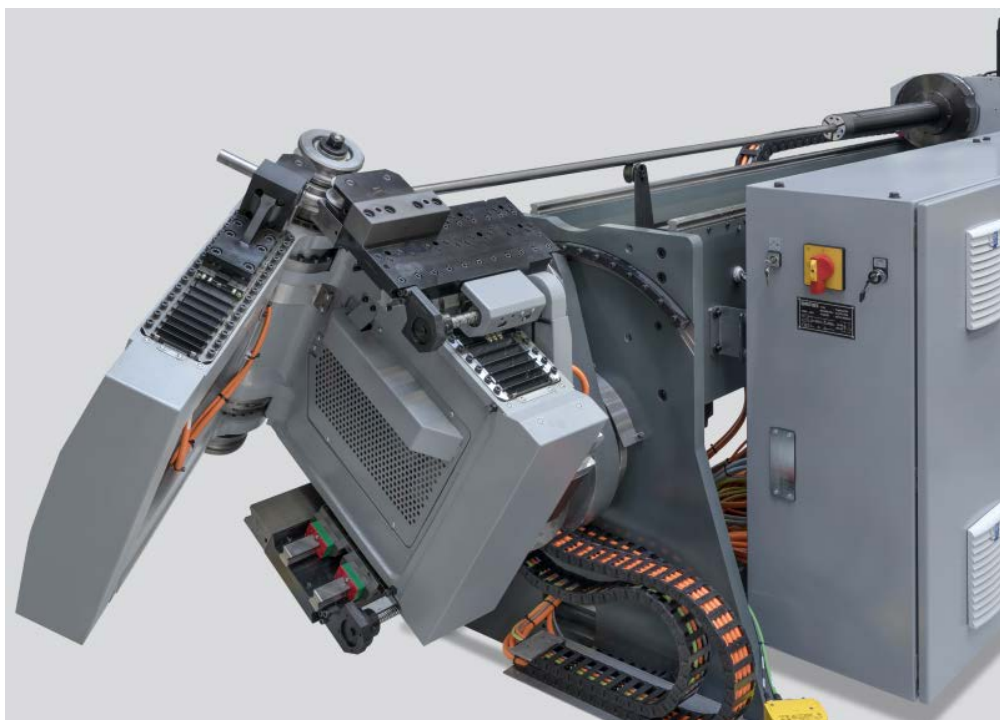
Fig. 2 WAFIOS TopBend 35 Bending head