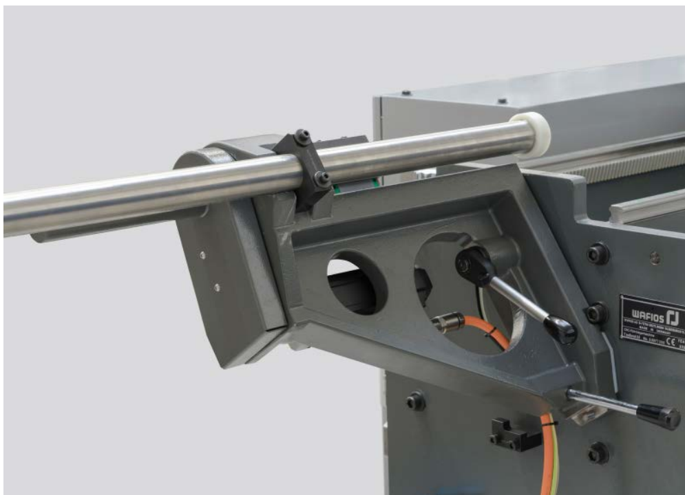
Fig. 3 WAFIOS TopBend Mandrel unit