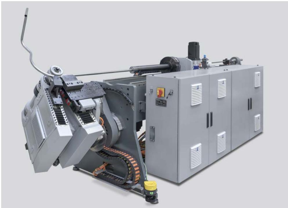
Fig. 1 WAFIOS TopBend 35

Save the date: WAFIOS Innovation Days in Reutlingen on May 3 - 7, 2021!