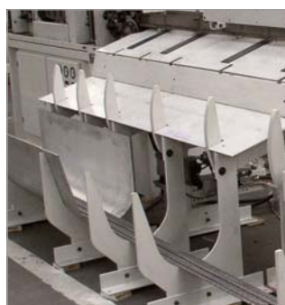
▲ Tilting and collecting station

High production output and a long service life will save money and shorten the amortization time of your investment.