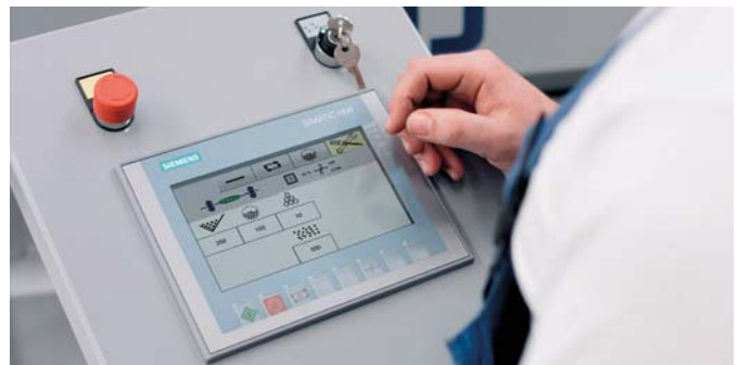
▼ Graphical operator guidance Touchscreen