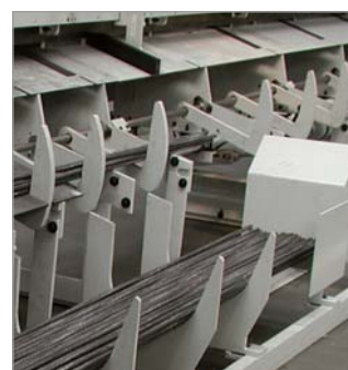
▲ Stop of tilting station and rod-end alignment