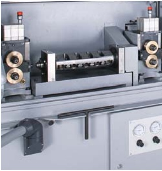
▼ Straightening rotor + Stationary cutting unit