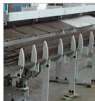
▲ Tilting station