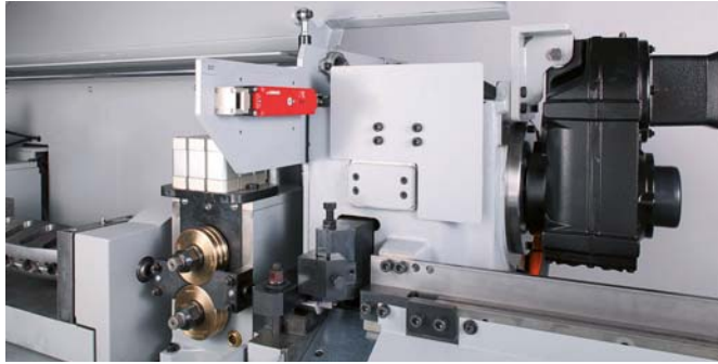
▼ Directly attached construction with release head and tilting station (option)