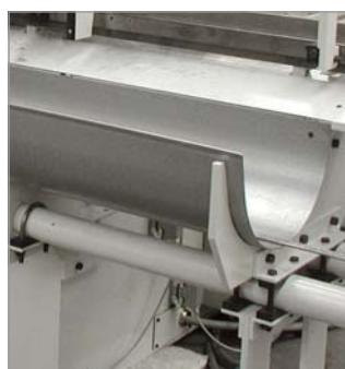
▲ Collecting trough

A high output and high machine availability are the result.